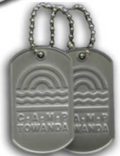
Item #: 09