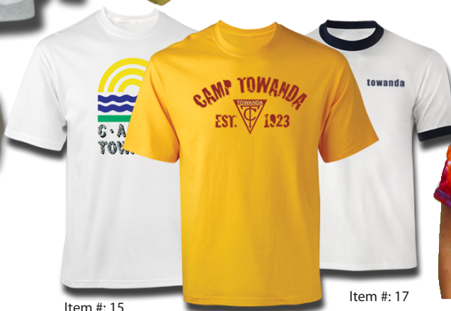
Item #: 15