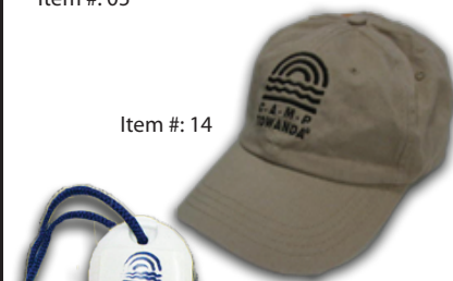
Item #: 14