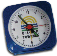
Item #: 03