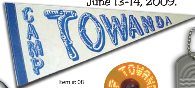
Item #: 08

Get your Towanda Gear in time for the Big 87/20 ALUMNI REUNION June 13-14, 2009.