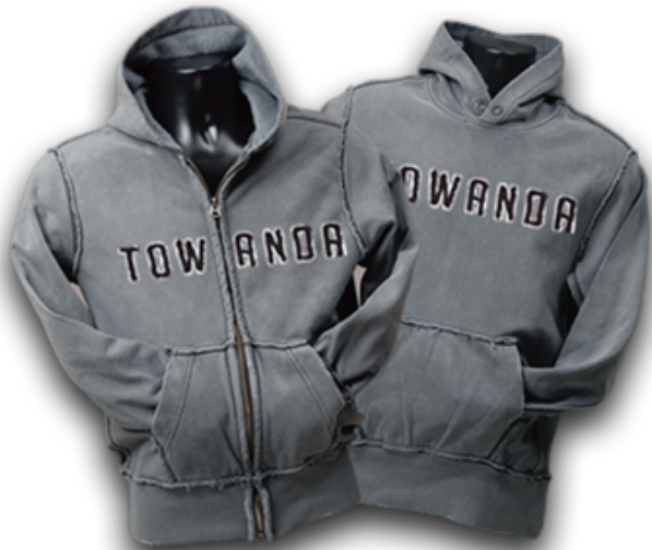
Item #: 01