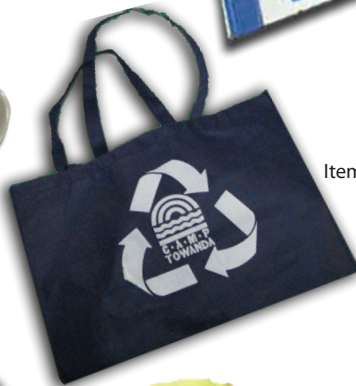
Item #: 07