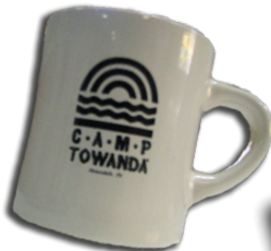
Item #: 04