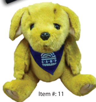
Item #: 11