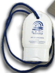
Item #: 18