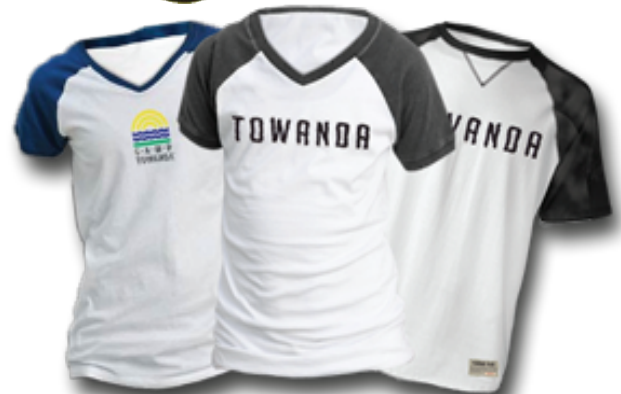
Item #: 12