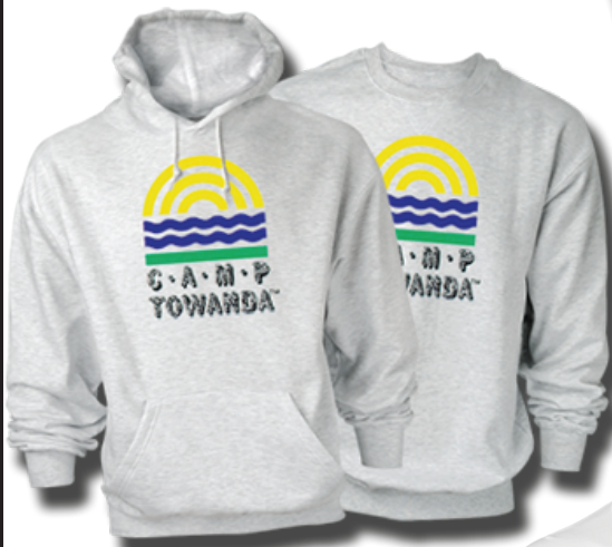
Item #: 05