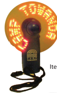
Item #: 10